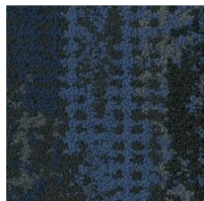
Deepest Skies 05486 LRV 5.3