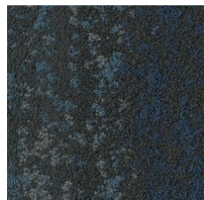
Lava Springs 05440 LRV 7