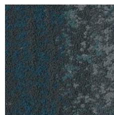
Calm Oceans 05405 LRV 5.6