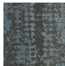
Wild Flora 05411 LRV 8.2