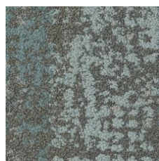
Mountain Lake 05327 LRV 15.3