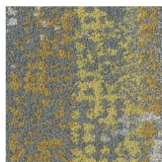
Optimistic Ochre 05225 LRV 17.8