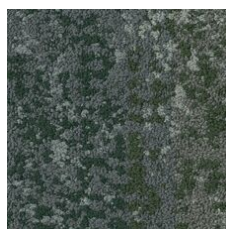
Untamed Forests 05334 LRV 8